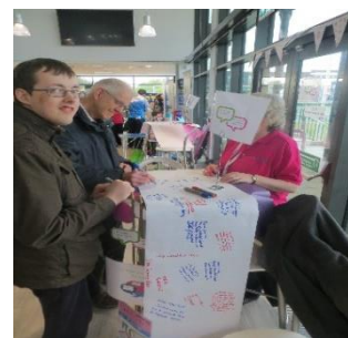
Gathering people's views at writing tables.

Volunteers helped run the event and also gave talks promoting the benefits of involvement.