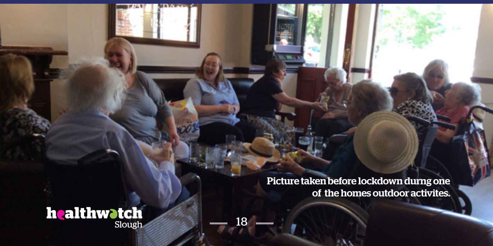
Picture taken before lockdown during one of the homes outdoor activities.