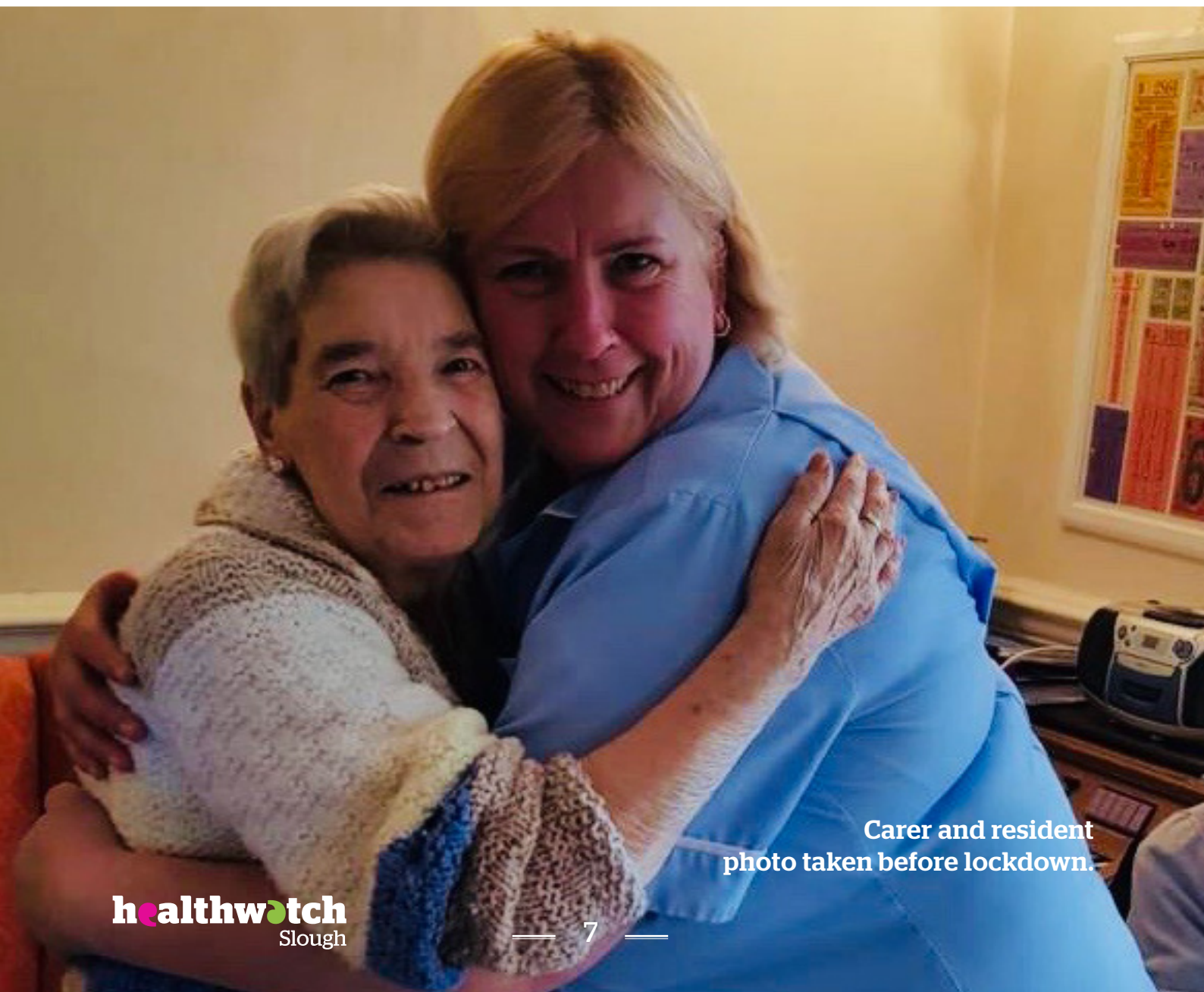
Carer and resident photo taken before lockdown.

“ We realise the importance of valuing our staff and to retain and train them to the highest level. We develop and promote staff where we can. ” - Manager