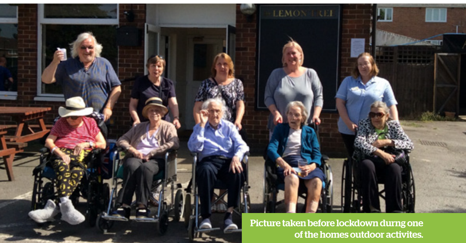
Picture taken before lockdown during one of the homes outdoor activities.